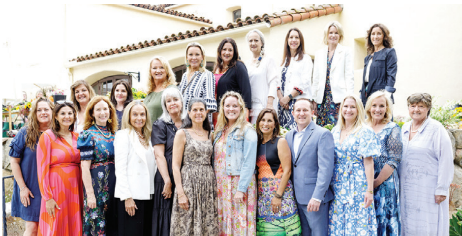
Flower Empower Luncheon Committee with Dream Foundation Staff