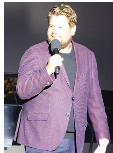
Adderley Gala Emcee James Corden