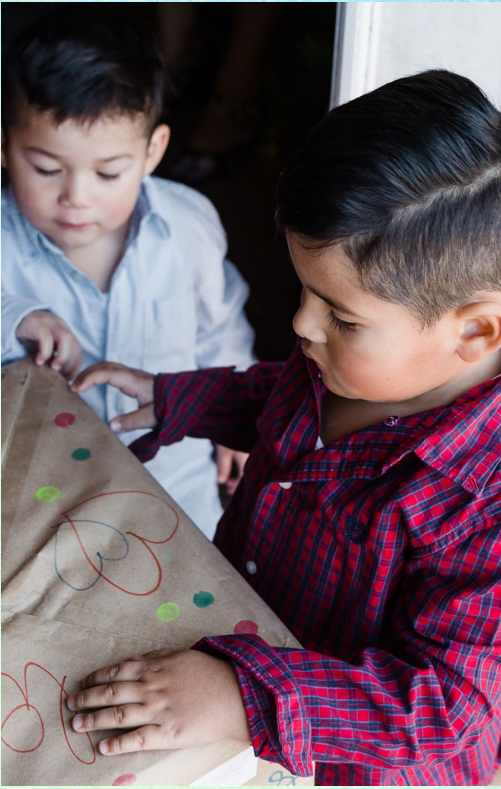
A toy box delivery to the children of Dream recipients lets kids be kids again!