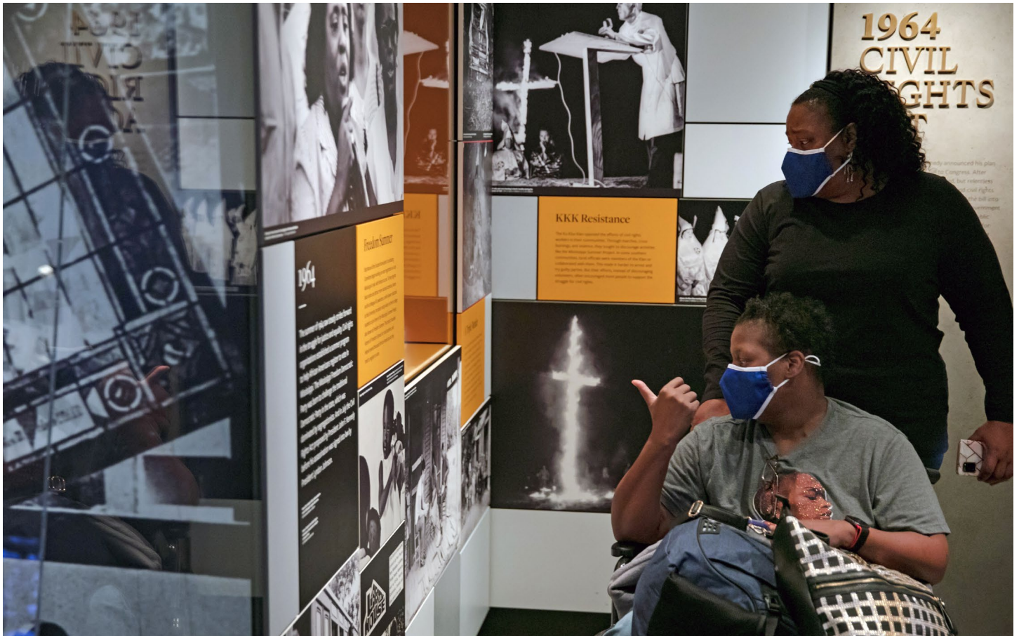
Meme loved discovering more about the positive aspects of Black culture.